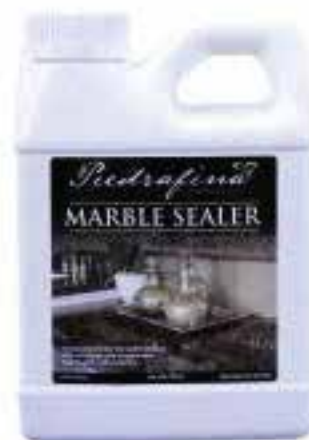
1 PINT SEALS 200 square feet